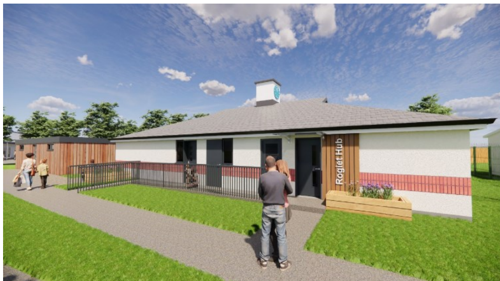
Perspective view showing access improvements and new sports changing cabin

<<< We now need an experienced Business Case writer to help us with this next phase. See our vacancies article on Page 4. >>>