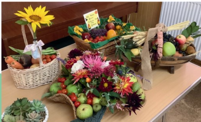
Harvest basket arrangements created by our members for our October members competition